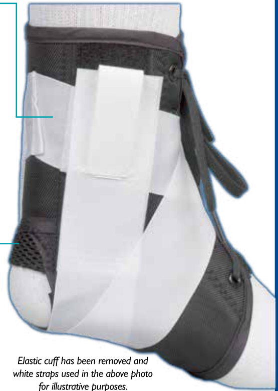
Elastic cuff has been removed and white straps used in the above photo for illustrative purposes.

CoolFlex ™ padding contains spandex fiber to provide superior comfort along the Achilles tendon and dorsum of foot. The shoe lace is attached to the tongue to ensure lace is always centered.