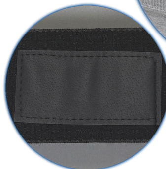
Lateral SkinLoc Pad