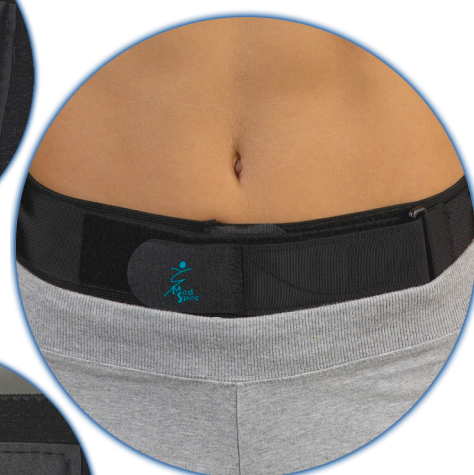
May be worn directly next to the skin