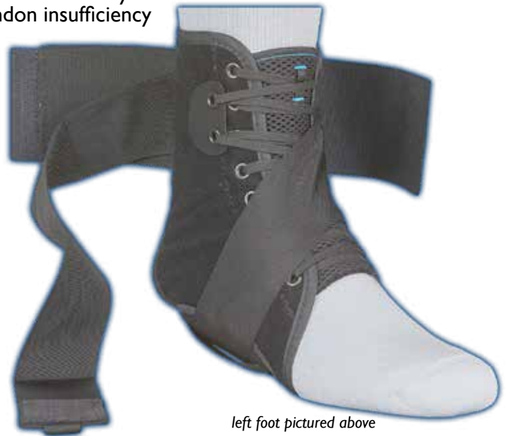
left foot pictured above